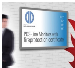
Image 1: Smoke and fire load optimized Monitors for areas with strict fire regulations