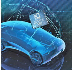
Image 1: Future-ready: KDPOF automotive Gigabit Ethernet provides electromagnetic compatibility, robustness, and smooth integration