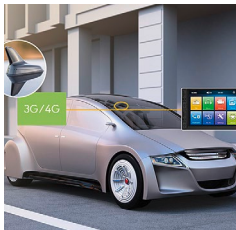
Image 1: KDPOF presents an optical link concept with Gigabit Ethernet over POF for telematics control modules