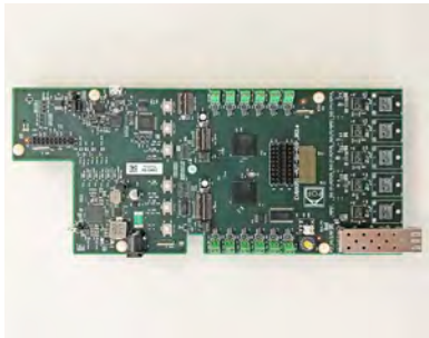
Image 1: KDPOF implements NXP SJA1110 SoC in new automotive Ethernet switch for high-speed connectivity

Download: https://www.ahlendorf-news.com/media/news/images/KDPOF-evb9351-aut-sw-nxp-H.jpg